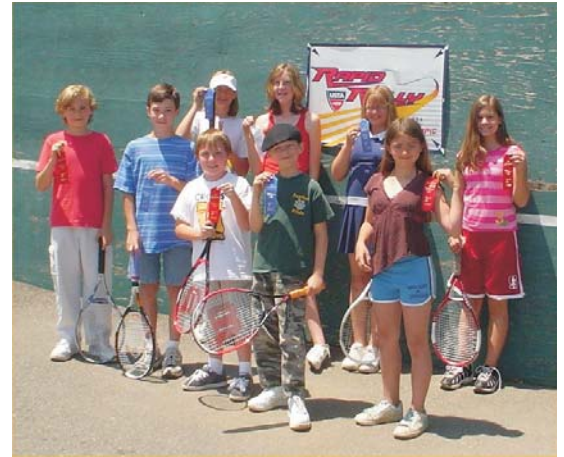
Last year's local Rapid Rally champs show off their ribbons!

So kids, start practicing! For complete rules and more info, see www.amadortennisclub.org/rapidrally.html